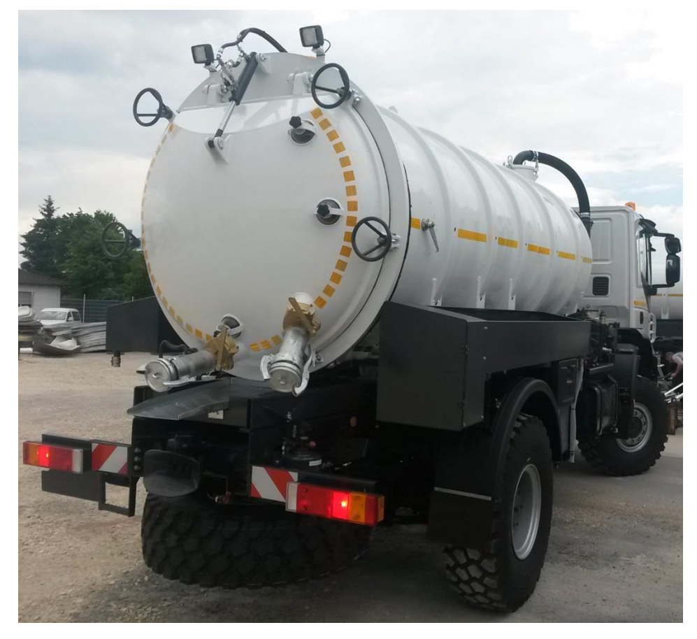
Vacuum tank truck 10 000 ltr. on IVECO 4x4 truck chassis (rear view)

Of course, smaller and bigger vacuum tank trucks and trailers are available.