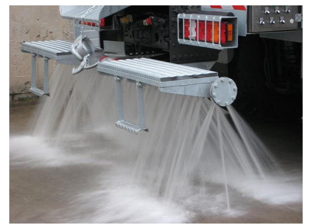
Spray bar front or/and rear (also available with adjustable nozzles)