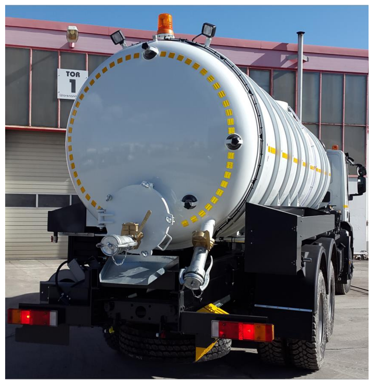
Vacuum Tank Version <u>without</u> hydraulic rear opening, but incl. manhole 600 mm = Less cost <u>Information</u>: Off-loading of Vac trucks is always by pressure. Lockable control box on the right (black color).