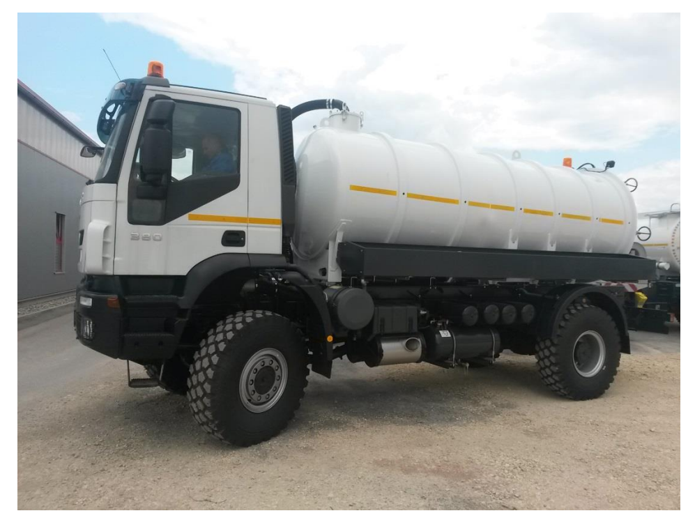
Vacuum tank truck 10 000 ltr. on IVECO 4x4 off-road truck chassis (side view)