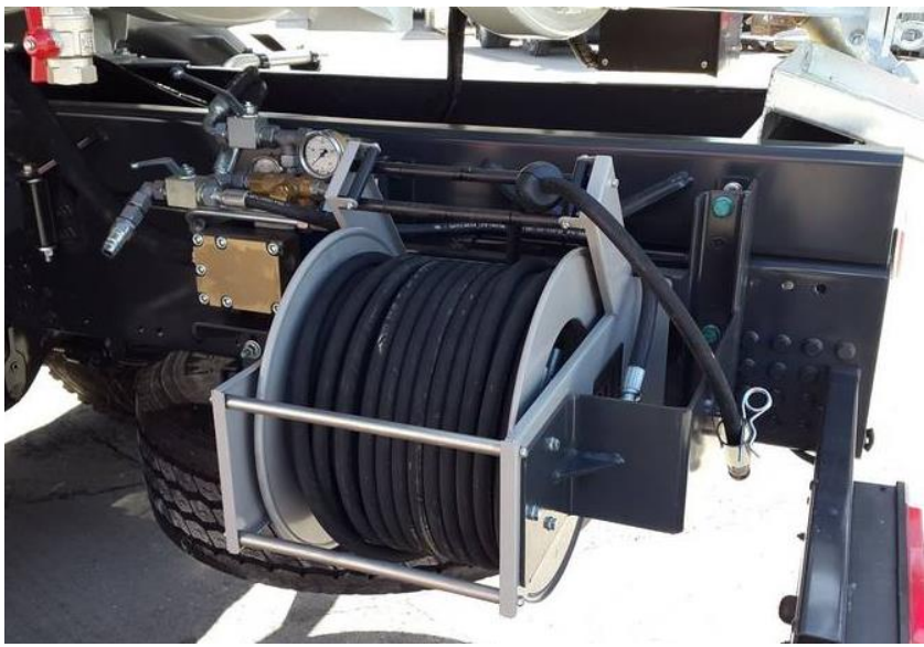
High pressure system with hose reel can be mounted RHS or LHS