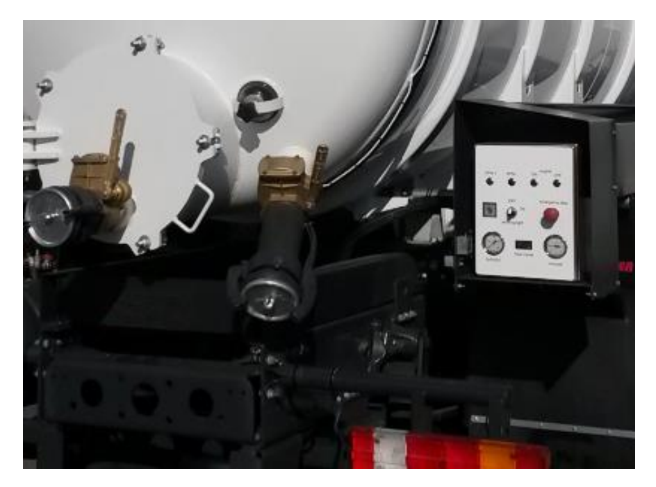
Rear view. Man hole 600 mm. Open control box on the right.

<u>Rear view</u>. Man hole 600 mm. Lockable control box (white color) on the right. Rotating beacon and two working lights. Subframe hot-dip galvanized.