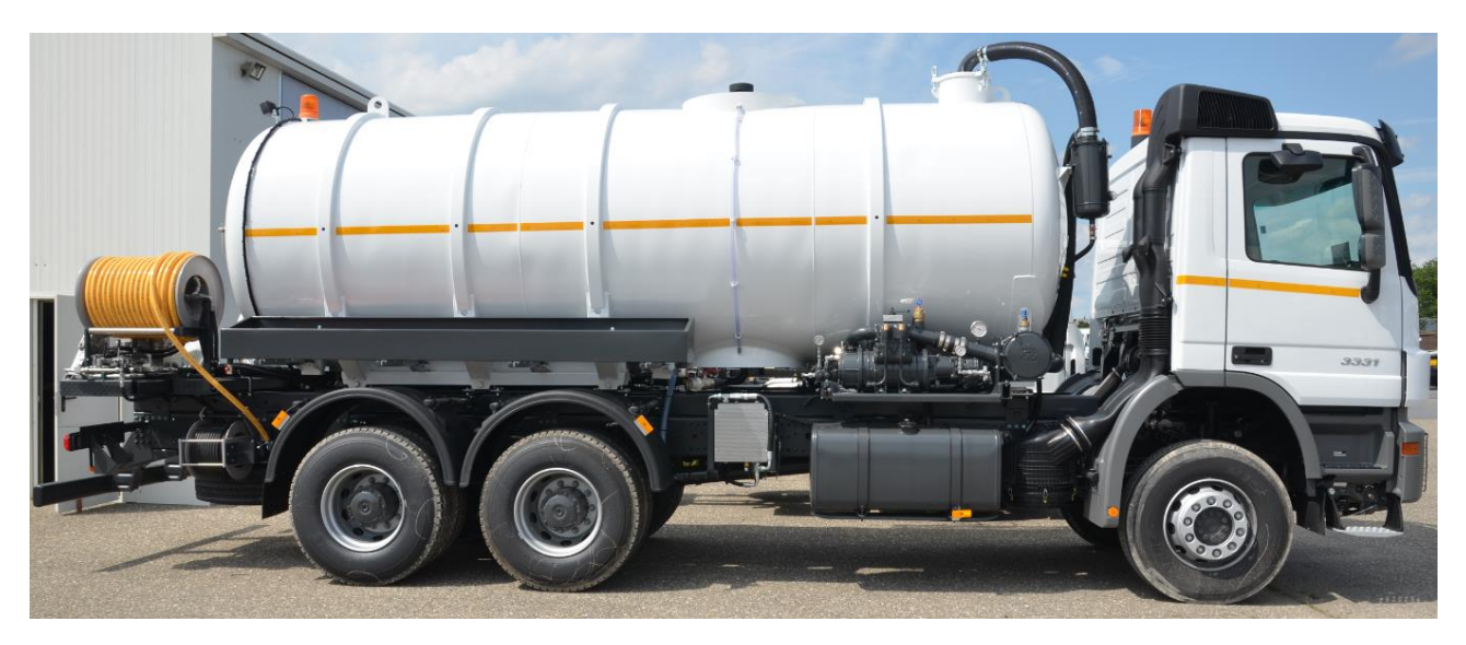
VACUUM – JETTING – <u>FLUSHING</u> – TANK – TRUCK. Capacity: 180000 ltr. (17 000 ltr. vacuum tank and 1 000 ltr. fresh water)