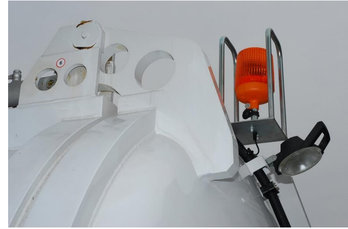
Rotating beacons and working lights