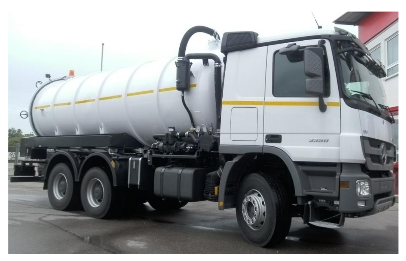
Vacuum Tank Truck 20 000 ltr. capacity