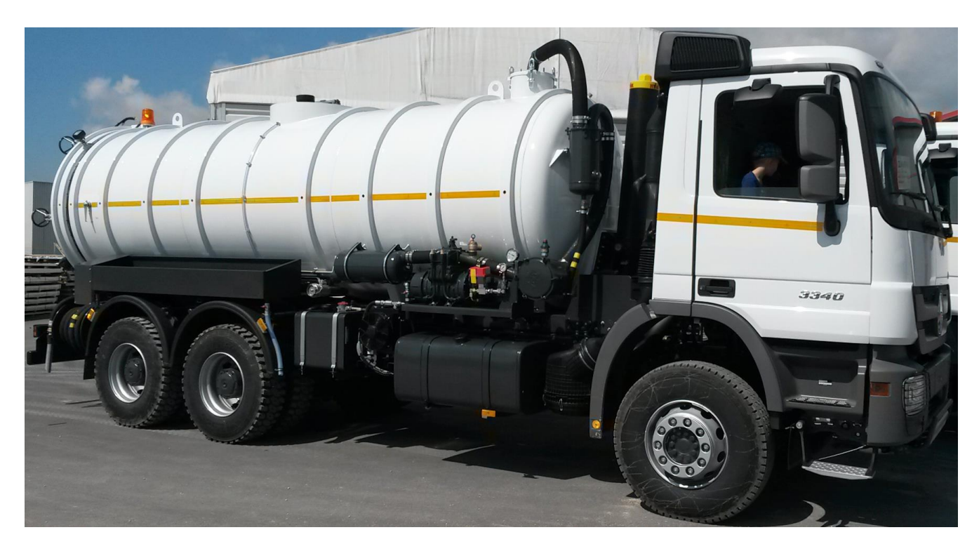
VACUUM – <u>JETTING</u> – TANK – TRUCK. Capacity: 18 000 ltr. (17 000 ltr. vacuum tank and 1 000 ltr. fresh water) Description on page 15