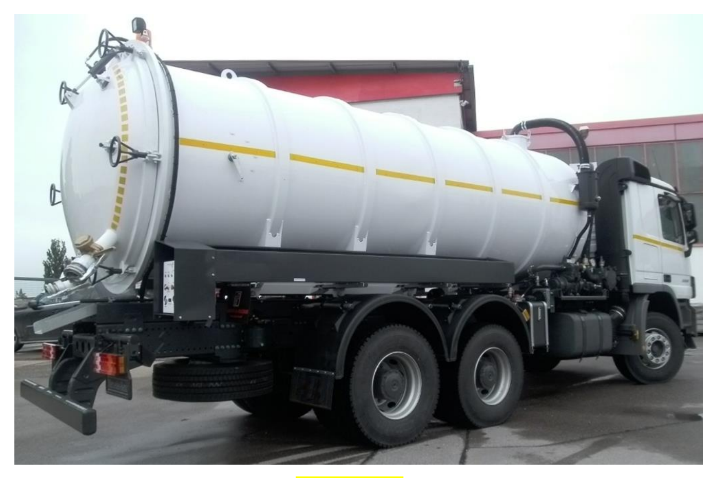
Hydraulic operated full rear opening of the vacuum tank