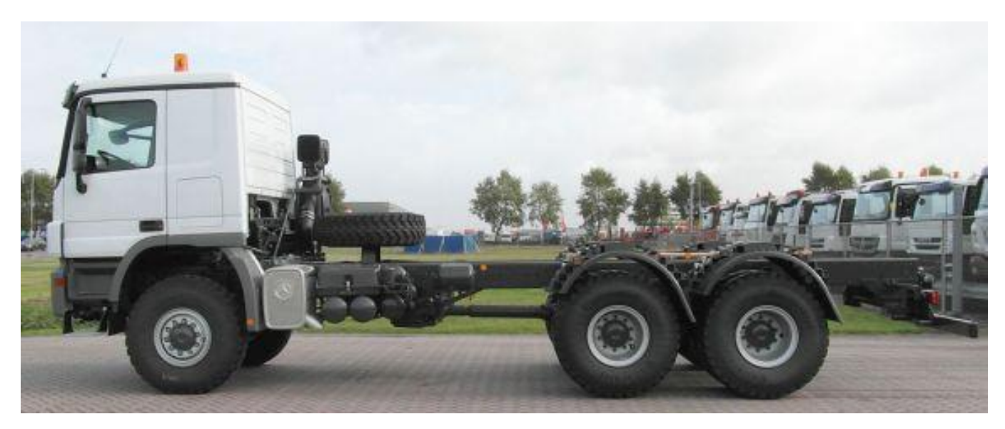
Truck chassis (6x6). Wheel base 4500 mm. M- or S-Cabin. 40 tons. Version (9/16/16 tons. axles)